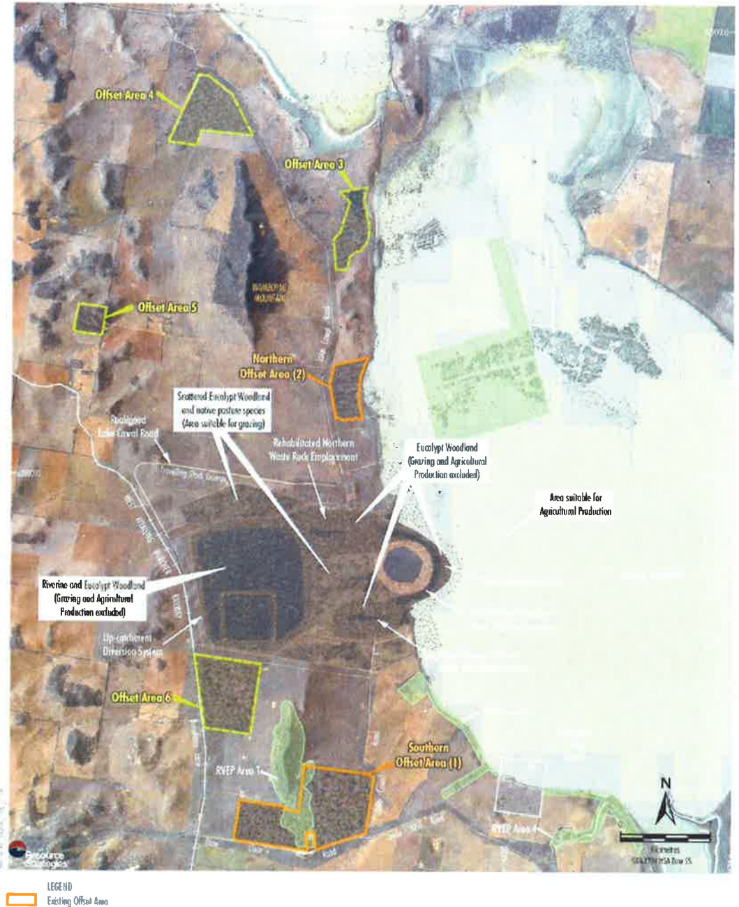
APPENDIX 3 BIODIVERSITY OFFSETS AND CONCEPTUAL REHABILITATION STRATEGY

Ecouries Offsat Asso (Voluminary Plonang Agree meet to be mgittered on the falls of the hands) Proposed Offsat Asso (Piolosating Agreement to be registered on the title of the bands) Rarn samt Vagatation Enhancement Program Asso (Nonegramment of these mace would be maintained for the tomm of Evolution's newse of the Land)