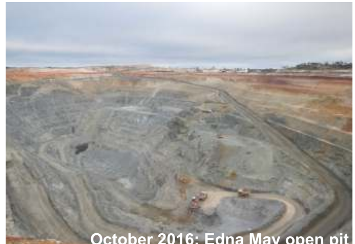
October 2016: Edna May open pit