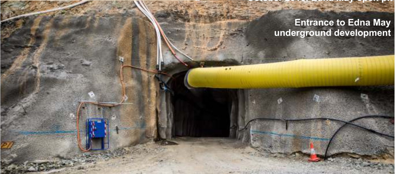
Entrance to Edna May underground development