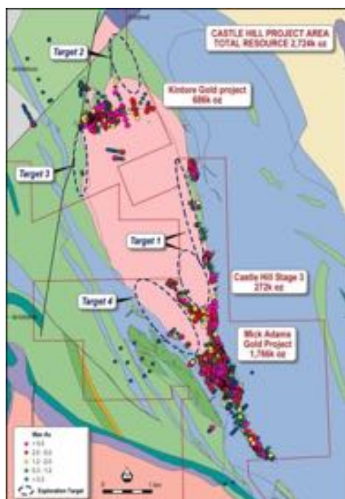
Figure 2: Castle Hill project location and regional geology