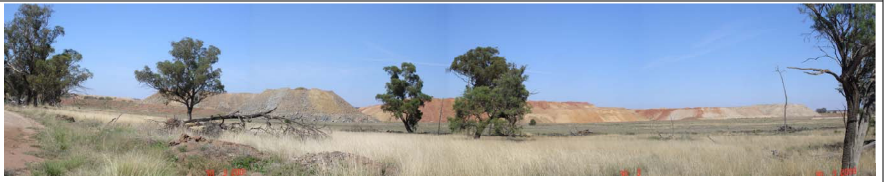
Northern waste rock emplacement area (looking south from the old Explosives storage area) April 2009