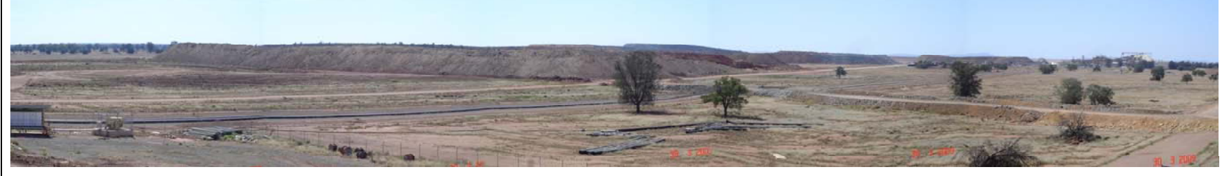
Northern waste rock emplacement area (looking North from the STSF Wall) April 2009