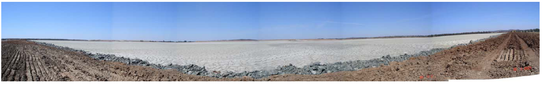
Northern Tailing Storage Facility during construction of the next lift (looking southeast April 2009).

5.3 Management of Retained Water – Cyanide Management