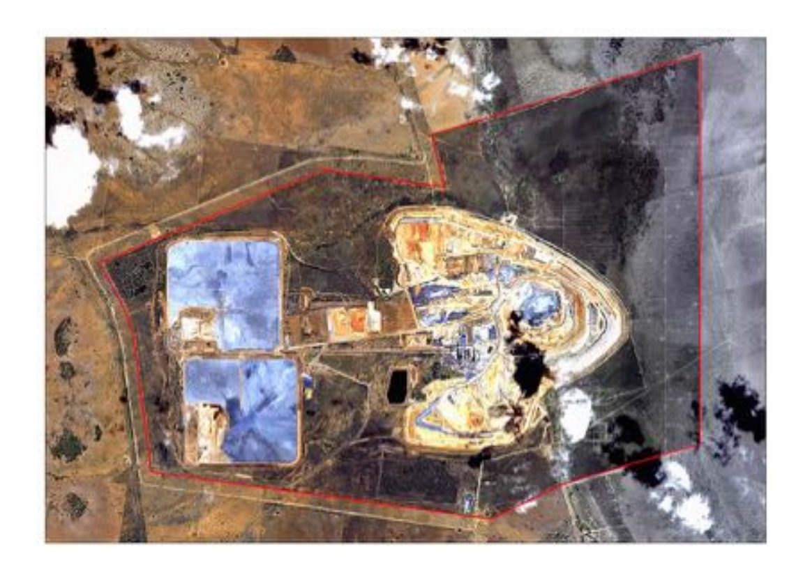
Plate 1: Cowal Gold Project Layout (Satellite Photo January 2009)