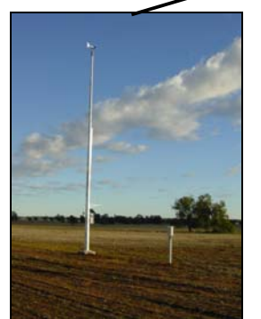
Plate 4: Meteorological Station.