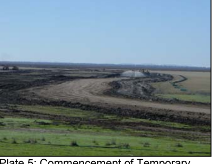
Plate 5: Commencement of Temporary Isolation Bund.