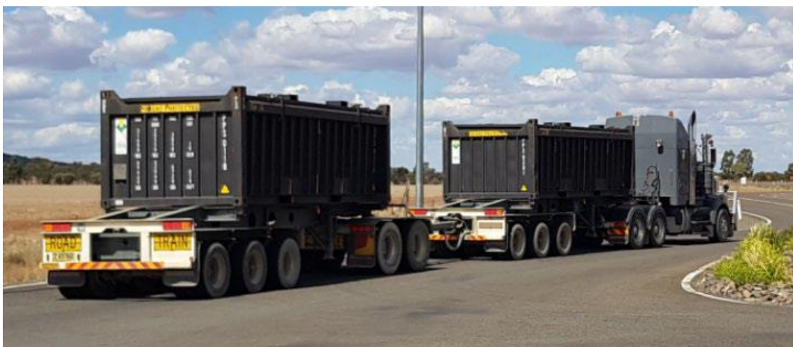
Figure 2 A-Double Configuration

These vehicles, a picture of which is provided by Figure 2 , are 28.4 m in length and operate with 11 axles. The arrangement is only slightly longer than a B-Double arrangement (26 m) and much shorter than a traditional A-Double arrangement (36.5 m).