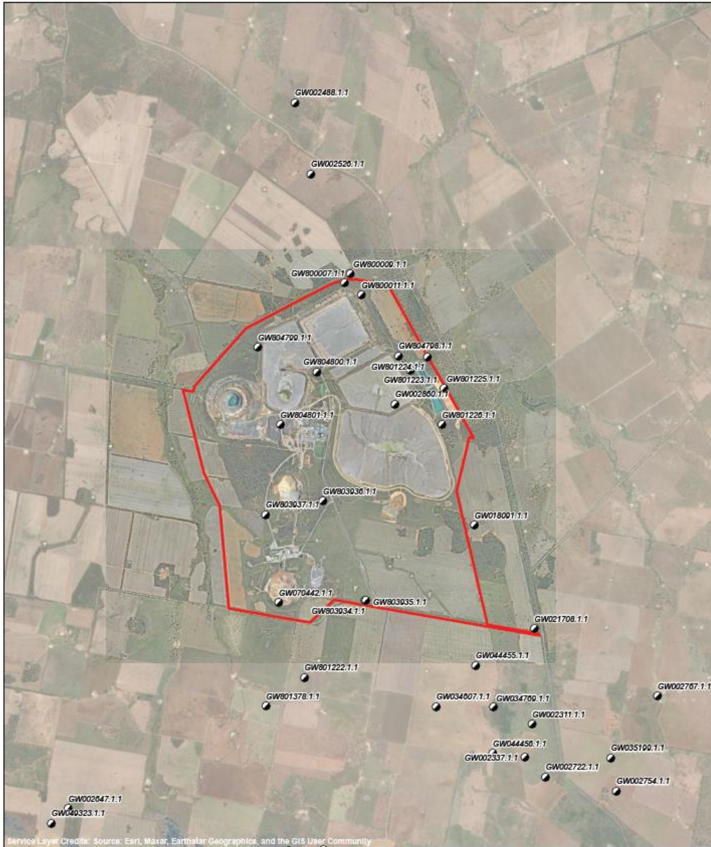
Figure 2 Registered groundwater bores