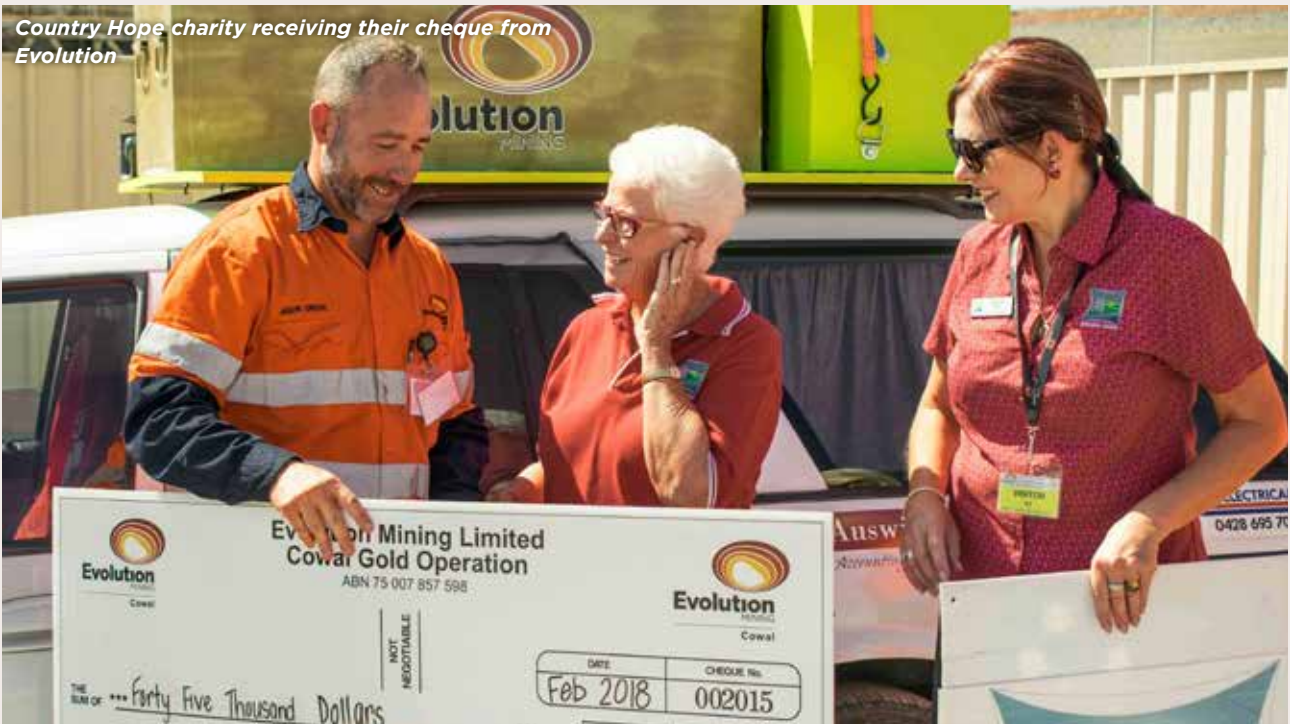
Country Hope charity receiving their cheque from Evolution