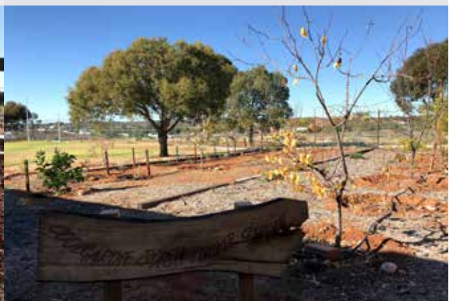
Bush tucker garden - Coolgardie Primary School