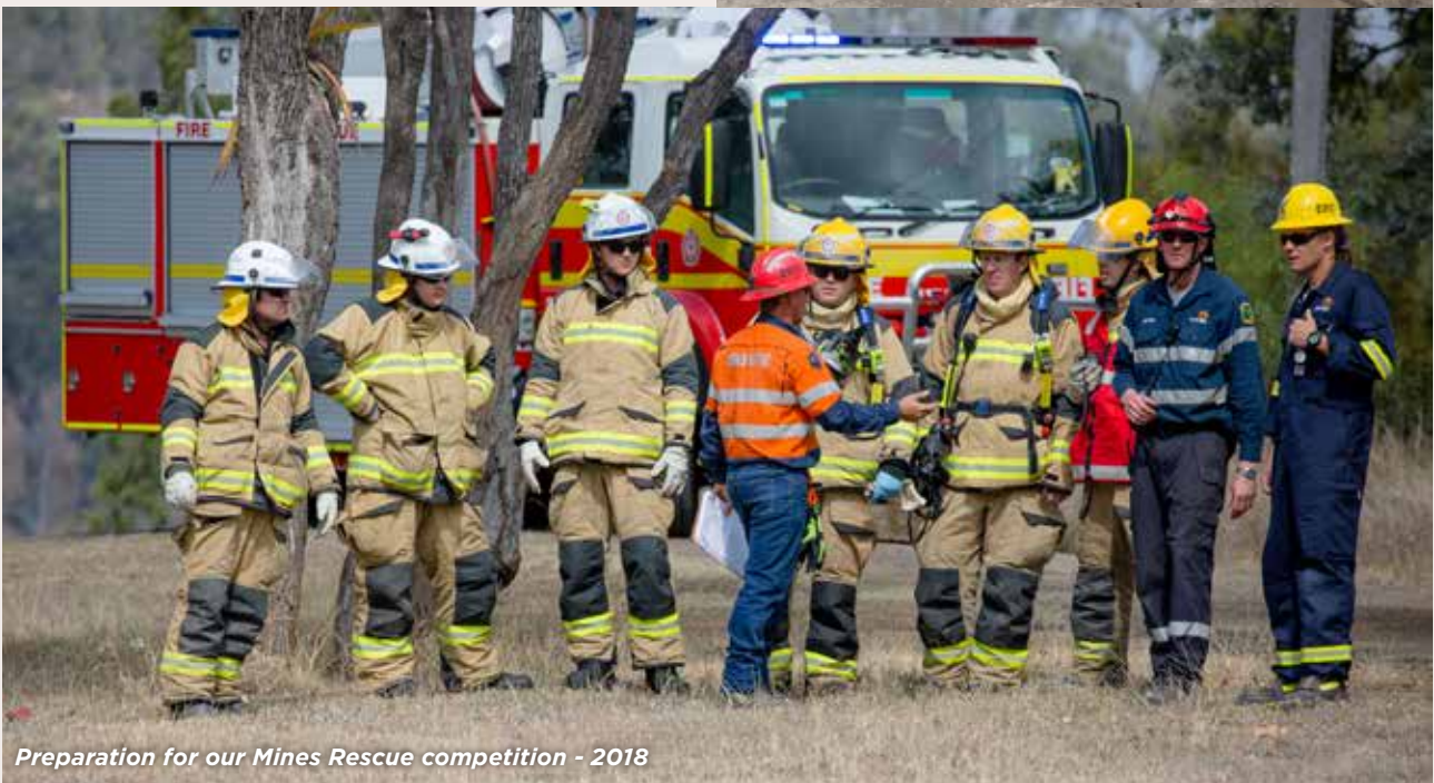
Preparation for our Mines Rescue competition - 2018