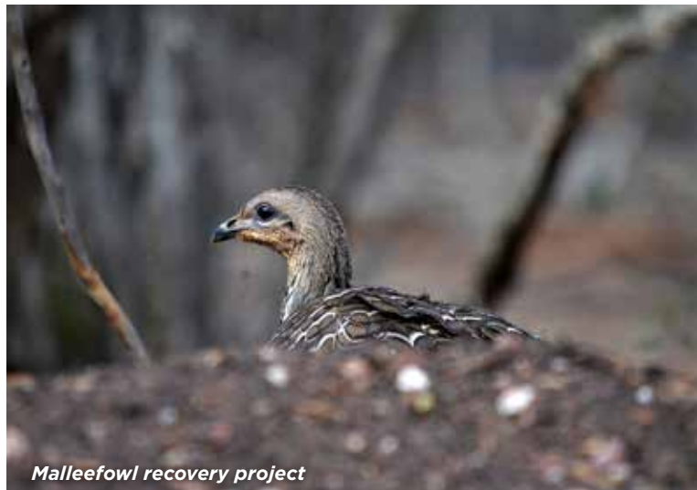
Malleefowl recovery project