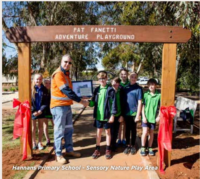
Hannans Primary School - Sensory Nature Play Area