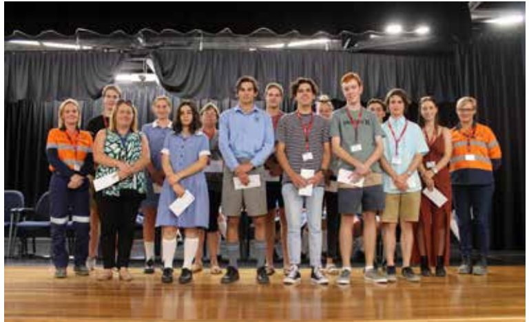
Recipients of the Endeavour Scholarship Program

Cowal's Endeavour Scholarship Program assists local students in the Bland, Lachlan and Forbes Shires to meet the costs associated with attending university. Run by Cowal since 2006, $15,000 is provided each year to four local schools: Red Bend Catholic College, Forbes High School, Condobolin High School and West Wyalong High School, who select the student recipients.