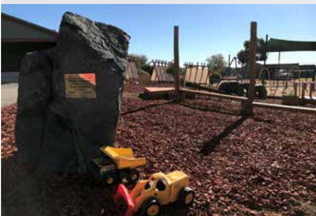
Sensory nature play area - Coolgardie Primary School

Community Citizen of the Year for our contribution to the community, which included two Shared Value Projects - construction of a sensory nature play area and bush tucker garden in Coolgardie Primary School, and a youth park in the community centre.