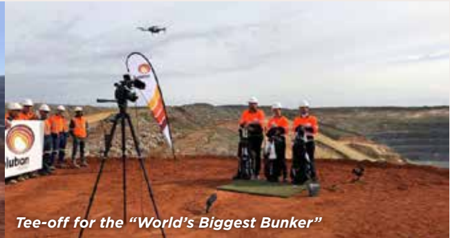
Tee-off for the "World's Biggest Bunker"

was captured by the PGA media team showcasing the Mungari White Foil open pit as the World's Biggest Bunker. The camera crew captured shots of the three visiting professional golfers doing their best to navigate the unique par 3. The final version of the World's Biggest Bunker promotional video was awarded the 'Best Visual Presentation' for the 2018 Australian Golf Media Awards.