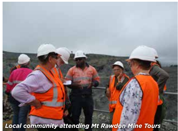
Local community attending Mt Rawdon Mine Tours