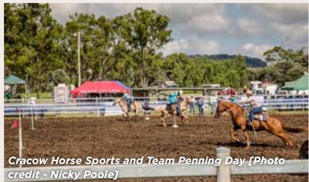
Cracow Horse Sports and Team Penning Day