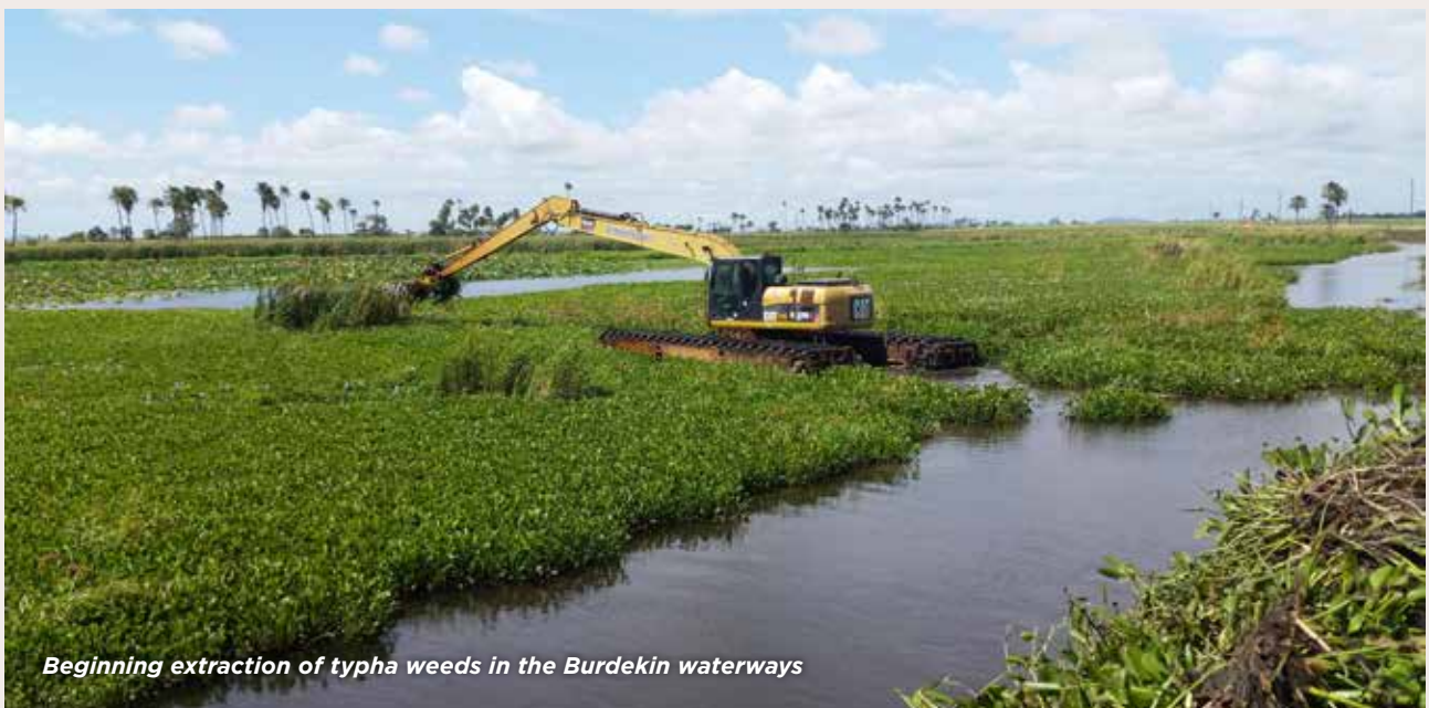
Beginning extraction of typha weeds in the Burdekin waterways

Our EEP's create or sustain aspects of our natural environment and include natural resource management, protecting threatened species, removing weeds and pests, improving biodiversity and exploring innovative ways to reuse waste.