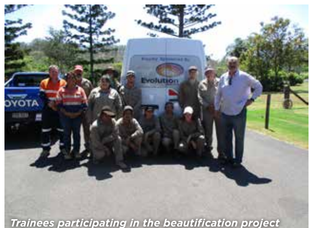
Trainees participating in the beautification project