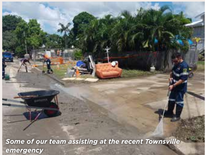
Some of our team assisting at the recent Townsville emergency

Our ERT provide valuable support in their local communities and also travel further afield to attend emergency situations if needed. An example of this was when Cowal's emergency response team were deployed in November to provide support during a severe weather event in metropolitan Sydney. As part of our partnership agreement with the NSW SES, four members of the Cowal emergency response team assisted with flood rescue operations and clean up activities, under SES command. Fortunately the team did not need to directly undertake a rescue but they were on stand-by if needed and stayed on to help members of the community repair storm damage and assisted with clean-up activities in the northern suburbs of Sydney. This is just one example of Evolution proudly working in partnership with the SES to support the wider community.