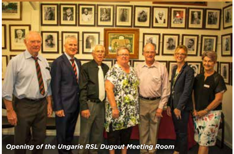
Opening of the Ungarie RSL Dugout Meeting Room