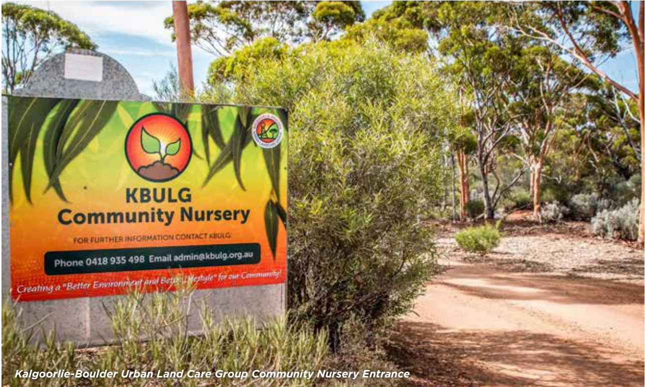
Kalgoorlie-Boulder Urban Land Care Group Community Nursery Entrance