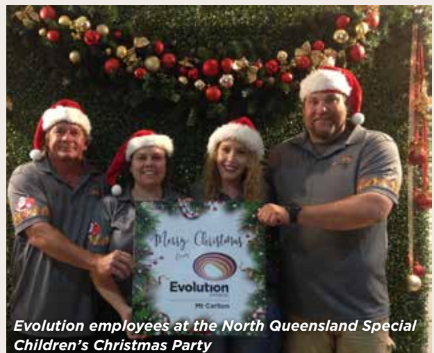
Evolution employees at the North Queensland Special Children's Christmas Party

Mt Carlton were gold sponsors of the North Queensland Special Children's Christmas Party in Townsville. Supporting Ronald McDonald House, hundreds of people attended the event, including fifteen volunteers from the Mt Carlton team who assisted with the set up and activities throughout the two fun-filled days. The event supports special needs children and their families, including those affected by serious illness, physical or intellectual impairment, domestic violence or living in underprivileged circumstances. The festivities are aimed at putting a smile on these children's faces and creating special memories.