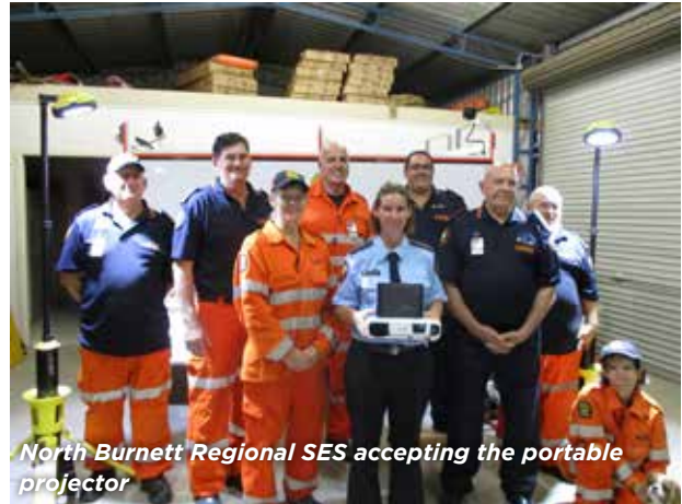
North Burnett Regional SES accepting the portable projector

In 2018 Mt Perry commenced a Beautification Project to spruce up their picturesque community, supported by the North Burnett Regional Council, Mt Perry Community Development Board, the Gidarjil Development Corporation and Evolution. The Gidarjil Development Corporation Landscaping and Horticulture trainees were engaged to undertake a large component of the project, including landscaping works around the Men's' Shed, drain clearing and stone pitching in eroding gullies, and establishing a native bush tucker garden. The project enabled the trainees to gain hands on experience and develop skills to support their completion of Certificate I in Conservation and Land Management, opening pathways to gain employment in the region. Evolution contributed to the purchase of a new bus for the Gidarjil Development Corporation to assist the trainees to move around the region and continue to participate in initiatives that enhance their traineeship outcomes.