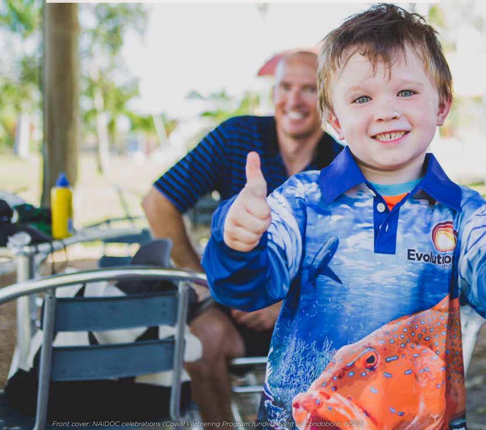
Front cover: NAIDOC celebrations (Cawal Partnering Program funded event at Condobolin, NSW)