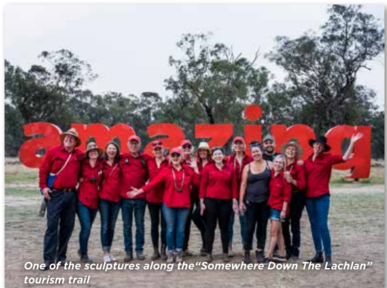
One of the sculptures along the "Somewhere Down The Lachlan" tourism trail