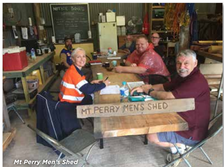
Mt Perry Men's Shed