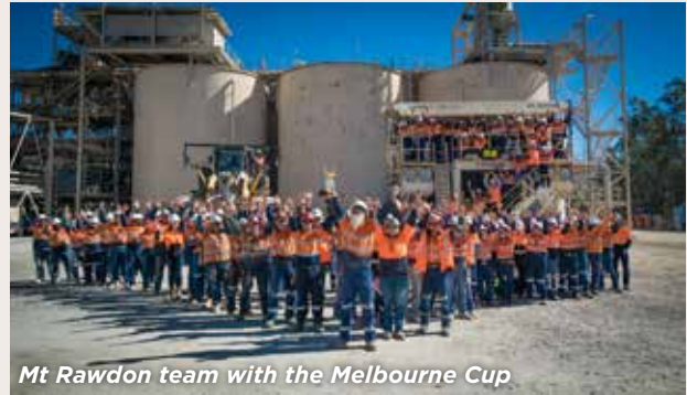
Mt Rawdon team with the Melbourne Cup