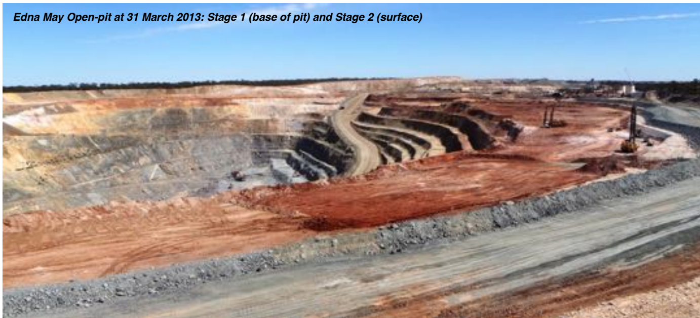
Edna May Open-pit at 31 March 2013: Stage 1 (base of pit) and Stage 2 (surface)

Year to date gold production stands at 67,545oz at a cash cost of A$868/oz. This compares with full year FY12 production of 73,264oz reflecting the material improvements made to the operation during FY13.