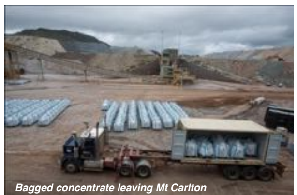
Bagged concentrate leaving Mt Carlton