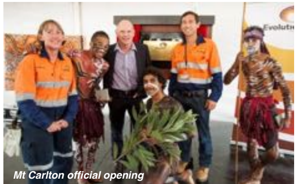
Mt Carlton official opening