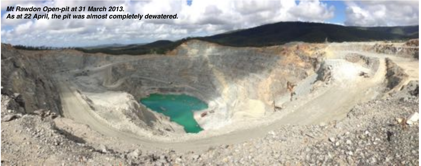
Mt Rawdon Open-pit at 31 March 2013. As at 22 April, the pit was almost completely dewatered.