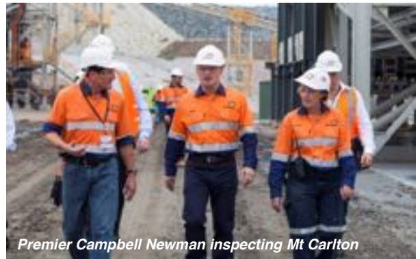
Premier Campbell Newman inspecting Mt Carlton

All operating costs are currently being capitalised while the plant is in ramp-up with the expectation that costs will be expensed during the September quarter when full throughput capacity is expected to be achieved on a sustainable basis.