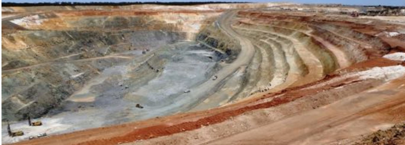
Edna May Open-pit: C Cutback December 2012