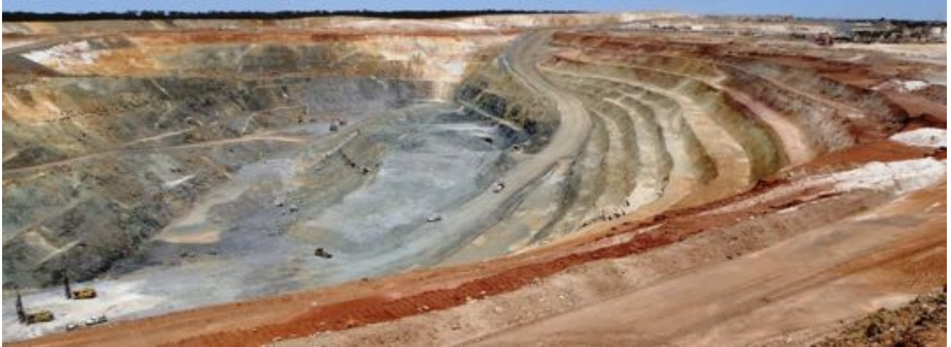
Edna May Open-pit: C Cutback December 2012