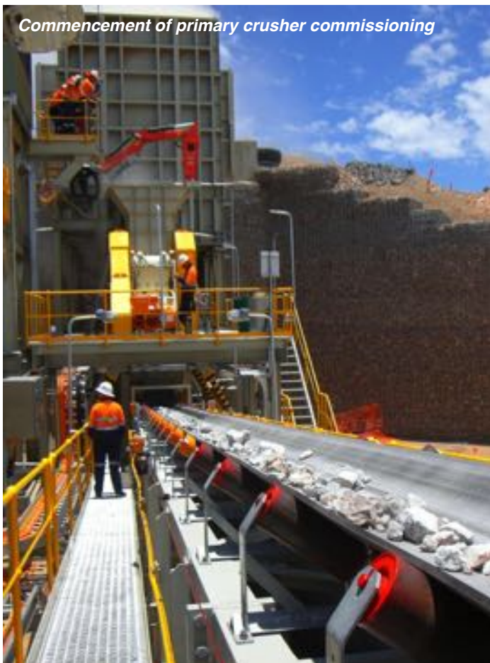
Commencement of primary crusher commissioning

The primary targets for the March quarter include operational readiness and integration of Evolution's processing team with the commissioning team to ensure a smooth transition into the operating phase.