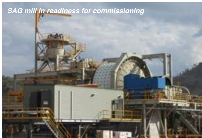
SAG mill in readiness for commissioning