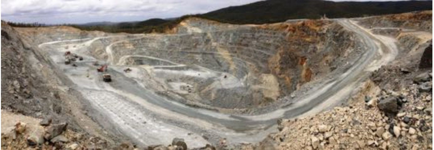
Mt Rawdon Open-pit: Stage 3 Cutback December 2012

A total of 850,281t of ore graded at 1.04g/t Au was treated in the quarter, a decrease on the September quarter (Sep 2012 qtr: 870,647t at 1.05g/t Au). Average throughput for the quarter was 9,242tpd (Sep 2012 qtr: 9,464tpd).