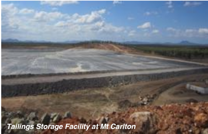
Tailings Storage Facility at Mt Carlton