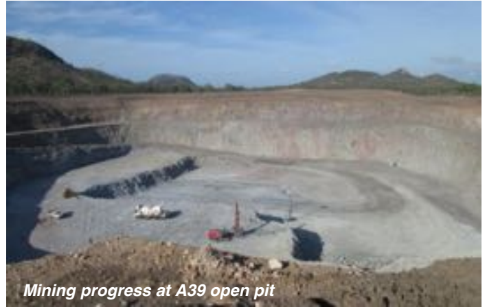
Mining progress at A39 open pit