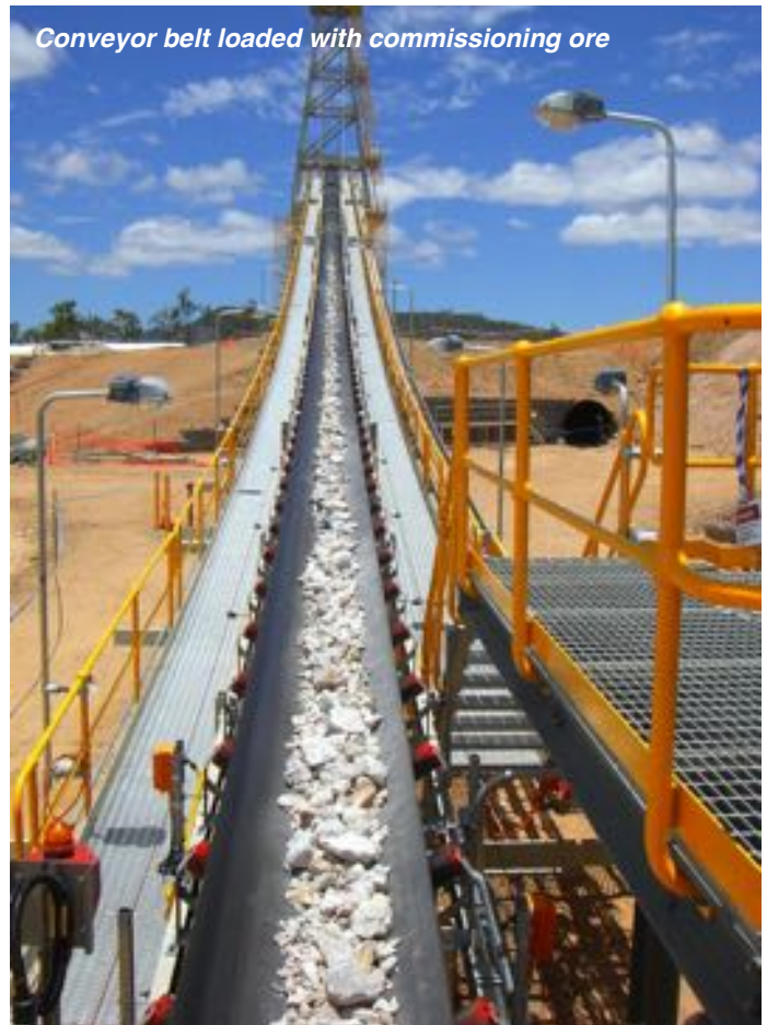
Conveyor belt loaded with commissioning ore