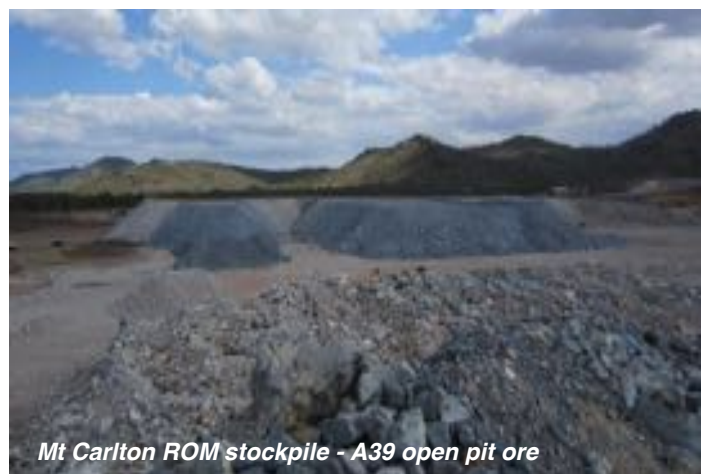
Mt Carlton ROM stockpile - A39 open pit ore