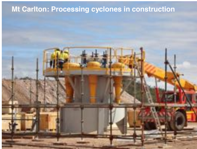
Mt Carlton: Processing cyclones in construction