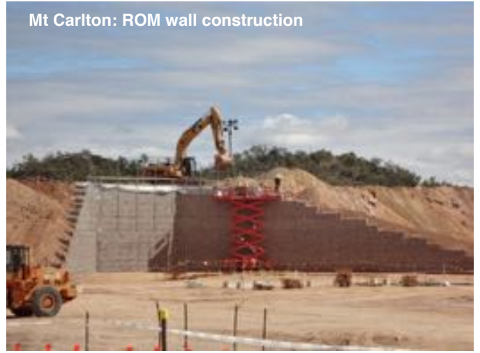
Mt Carlton: ROM wall construction