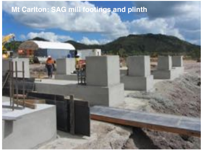
Mt Carlton: SAG mill footings and plinth