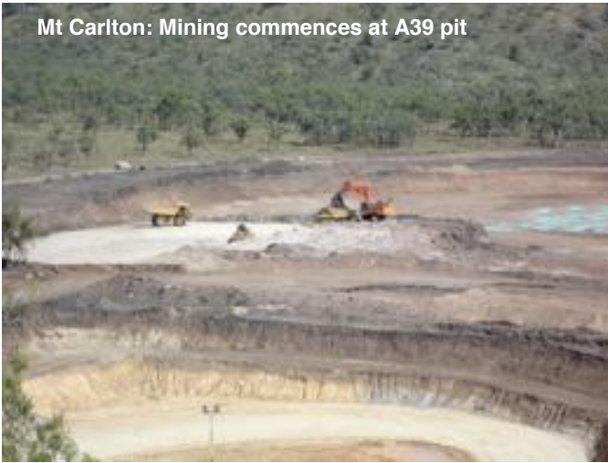
Mt Carlton: Mining commences at A39 pit