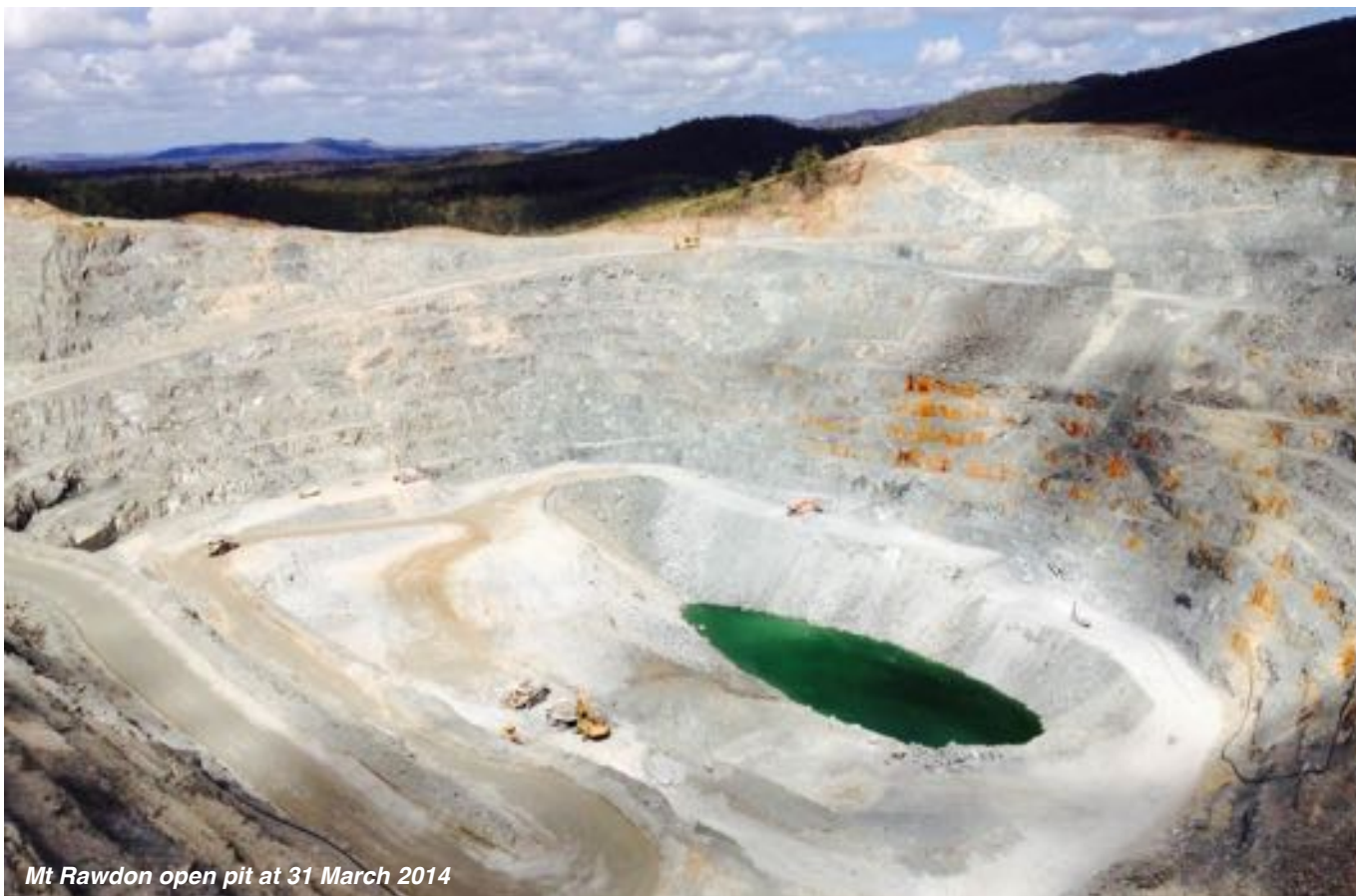
Mt Rawdon open pit at 31 March 2014

A number of productivity improvements are underway at Mt Rawdon. The western waste dump clearing and infrastructure construction is well advanced and will provide much shorter haulage distances for Stage 4 waste. Preliminary indications from the change to larger diameter (203mm) blast hole drilling, combined with electronic detonation, show productivity improvements and cost savings in the order of A$5 million per annum, as anticipated. As a result of the improved productivity the drill fleet has been reduced by 33% and production blast holes have been reduced by over 45%. This reduction in blast holes should further improve as the pit transitions from 10 metre benches (Stage 2) to 15 metre benches in the new pit design. Blasting fragmentation improvements have also translated to improved mill throughput. Early results show a 10% increase in throughput when processing harder volcanoclastic ores. This work will be verified as more of this material is mined over the coming months.