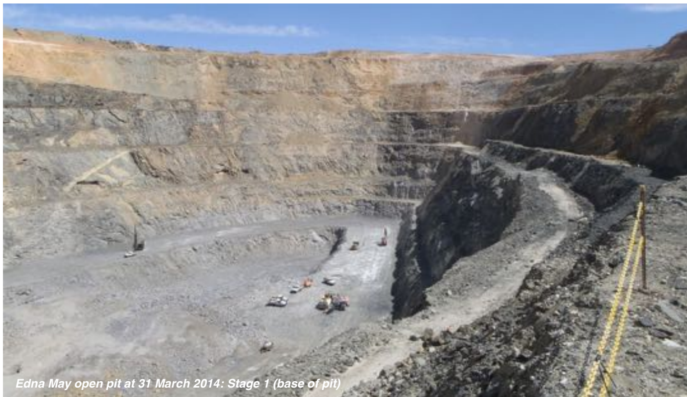
Edna May open pit at 31 March 2014: Stage 1 (base of pit)

Evolution has recently received expressions of interest from a number of parties interested in purchasing the Edna May mine. The Evolution Board and management are currently considering various options in relation to the mine, from continuing ownership to potential divestment.